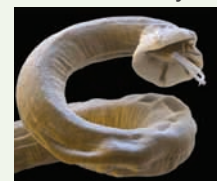
Electron micrograph of an adult lungworm

Once swallowed, the larvae migrate to the heart where they will develop into adult