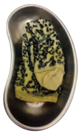
A very expensive sock that was removed from the intestines of a dog

So – as well as trying to ensure your pets don't eat these objects, we strongly recommend pet insurance to cover you against these unexpected incidents!